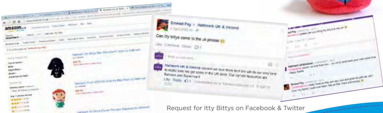
Request for Itty Bittys on Facebook & Twitter