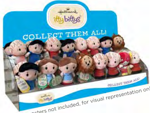
* Characters not included, for visual representation only.

7 tier FSDU unit allows for maximum Itty Bittys using minimum space. To fill order a selection of seven trays to suit your store!