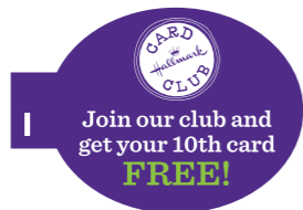
Bus Stop x20 per kit