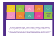
Loyalty Cards x1000 per kit