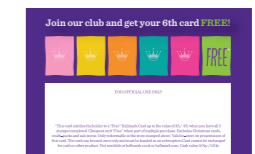
Loyalty Cards x1000 per kit