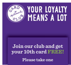
Card Dispenser x1 per kit