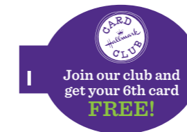
Bus Stop x20 per kit