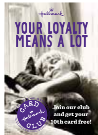
A5 Strutt Card x1 per kit

This kit contains the following elements: