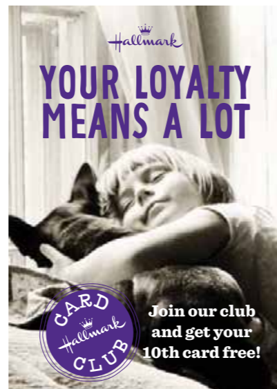
A3 Window Decal x1 per kit