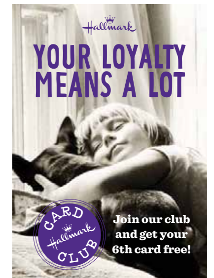
A3 Window Decal x1 per kit