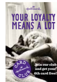
A5 Strutt Card x1 per kit

This kit contains the following elements: